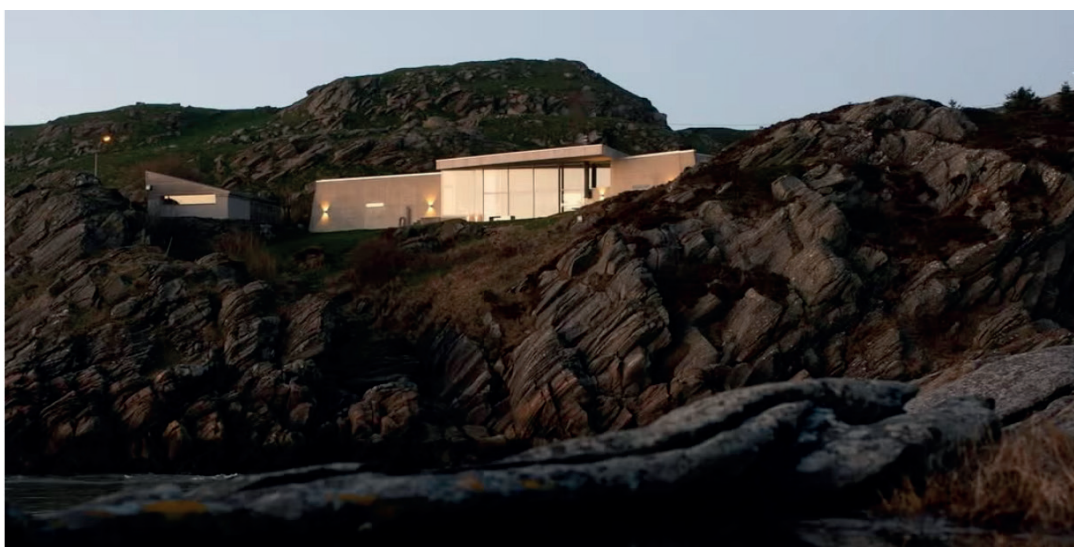
The Bolder Wave on Instagram

Between fjords, remote forests and seemingly endless skies, Scandinavian nature offers extraordinary retreats for those seeking fresh air, silence, harmony and new energy. In Iceland, Norway, Sweden and Finland, there are many retreats offering an immersive experience combining deep wellness, minimalist architecture and sustainable comfort. Here, luxury means being able to slow down and listen to the breath of the world. From geothermal springs overlooking the ocean to glamping under a starry sky, these properties promise an authentic and rejuvenating journey. Harper's Bazaar has chosen five destinations in Scandinavia that reinterpret the concept of a nature retreat for a stay you will never forget.